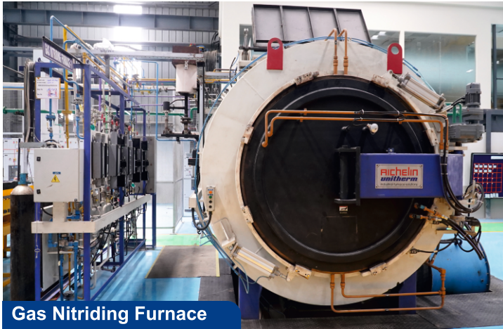
Gas Nitriding Furnace