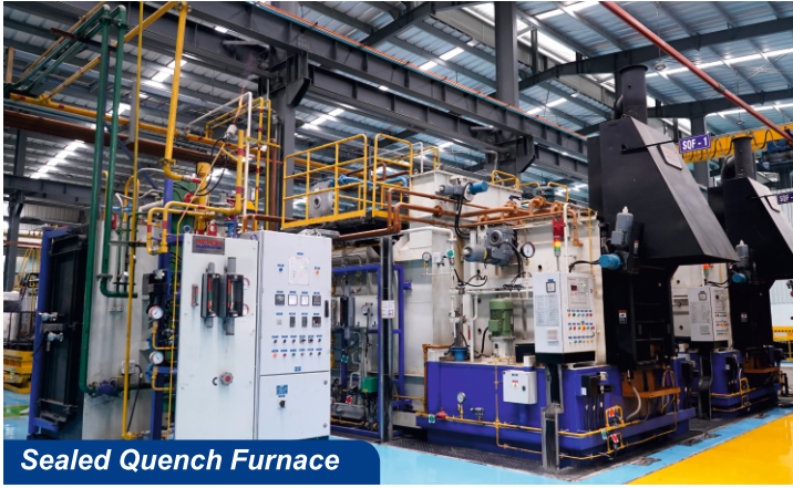
Sealed Quench Furnace